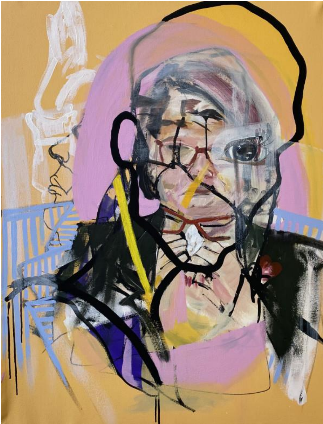
The Witnesses, No. 3 of 4 Pen, Acrylic Gouache & Acrylic On Canvas 40 x 30 x 1.5 in 2021 SOLD